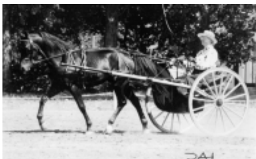
Top: Greentree Brigadier Bottom: Greentree Nightowl